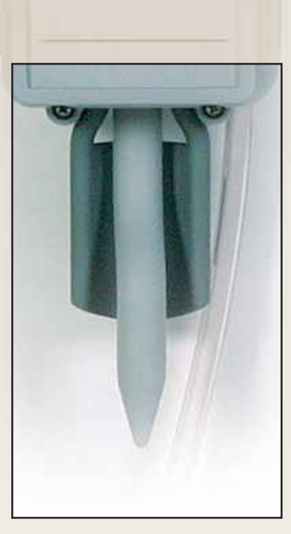
ONE HAND BOTTLE FILLING lever actuator and FILL TUBE designed to minimize excess foam