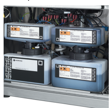
Unique Domino ink system