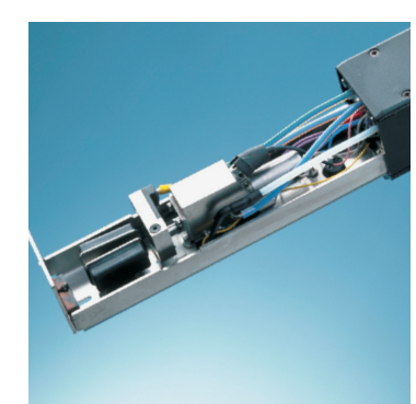
A-Series print head