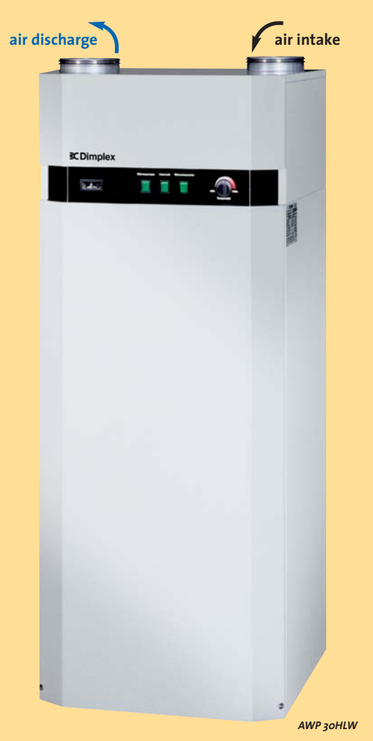
With the AWP 30HLW heat pump water heater, Dimplex offers the compact residential heat recovery ventilation system LWP 300 W (exhaust air volume flow settings: 230/185/120 m3/h). Building ventilation is effected via a 2-pipe residential ventilation system with central exhaust air and decentralised outside air supply systems via outdoor wall valves.