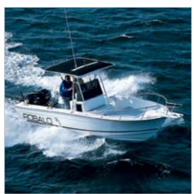
The World Standard