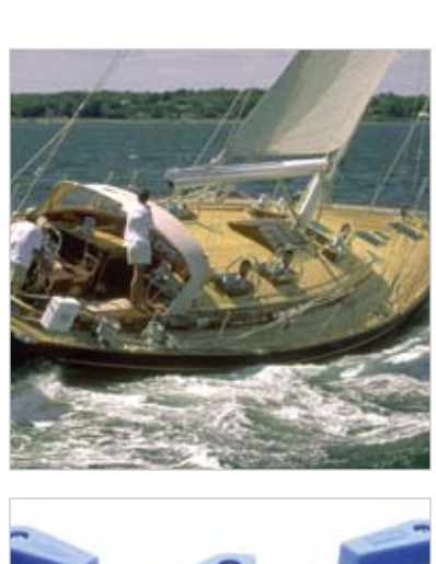
Catalog 3520 Summer 2006