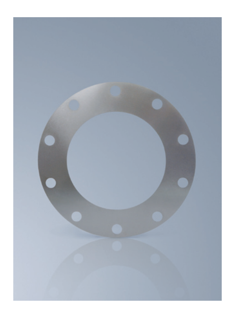
Typical EKagrip® friction shim design for a flange connection according to customer specification

EKagrip® friction shims and coatings provide a reliable solution to increase the coefficient of friction in bolted or hub-collar connections. They enable higher potential loads and torque rates with a compact and light-weight design.