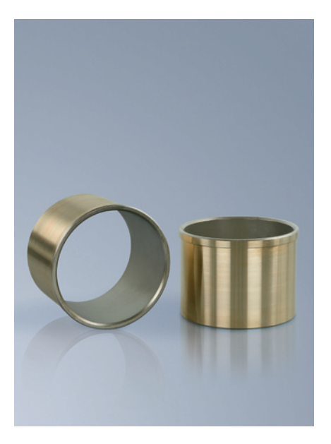
Direct coating with EKagrip® on a hub-collar connection